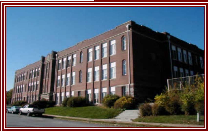
Park School Omaha, Nebraska