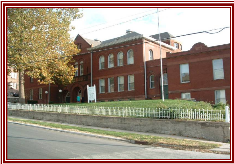
Columbian School Omaha, Nebraska